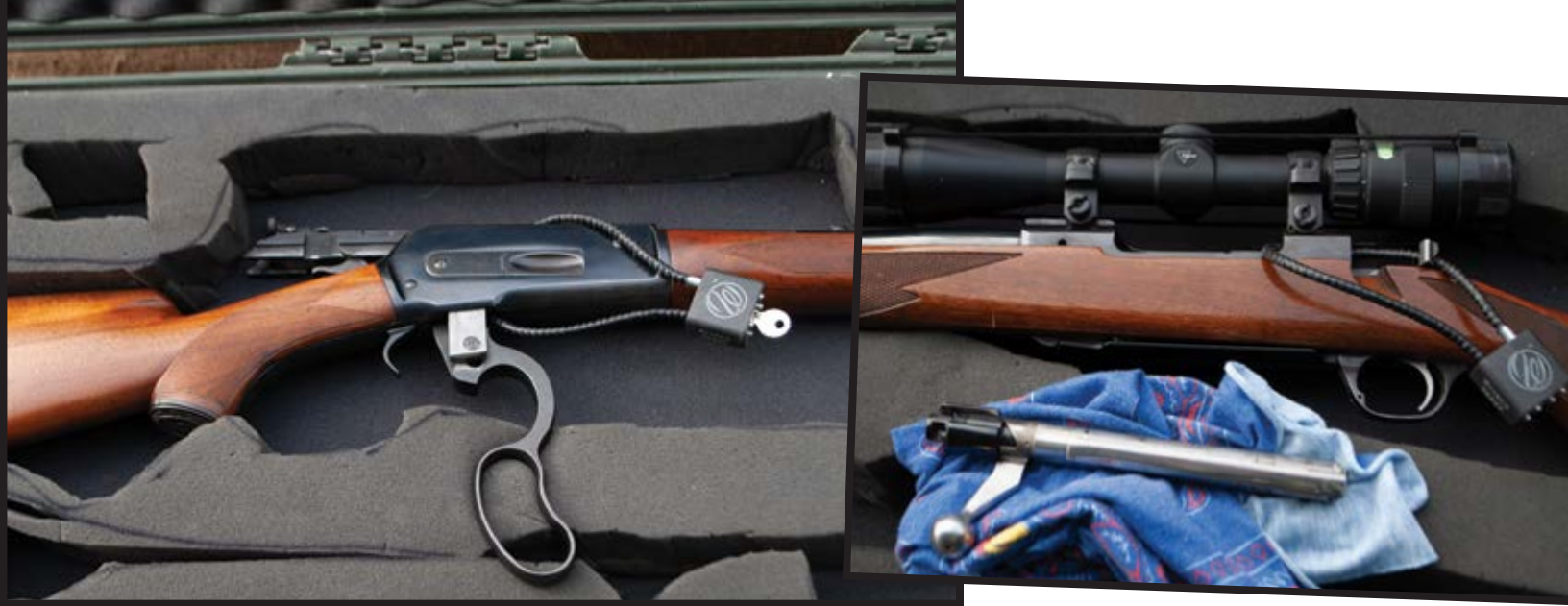
LEFT: When possible, bolts should be removed and padded separately in the gun case. When disassembly isn't possible, Boddington packs with action open, and adds a trigger lock or cable lock...just to keep inspectors very happy. RIGHT: Bolt actions are probably the easiest to disassemble and pack. Boddington wraps the bolt separately and pads it, then adds a cable lock through the action, just to make inspectors extra happy.

rules. Within the continental United States, long guns are usually simple. Handguns can be, but there are jurisdictions (such as New Jersey and New York City) where even transit with a handgun is unlawful.