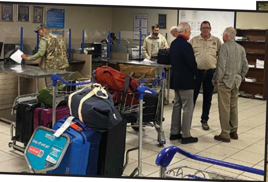
Every country has different rules, some more difficult than others. This is the police firearms office at South Africa's OR Tambo airport, clearing house for Africa's greatest number of hunters, and one of the world's simplest destinations for clearing firearms.

To make some hunting dreams come true, we must travel. Depending on where and for what, maybe we can make a road trip, but that often means getting on an airplane. Even the thought is daunting enough for folks who don't travel much, but now we must contemplate traveling with firearms, which is not hassle-free nor always possible.