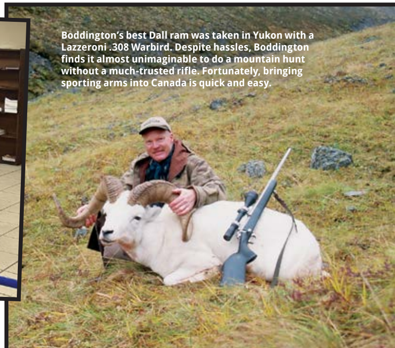
Boddington's best Dall ram was taken in Yukon with a Lazzeroni .308 Warbird. Despite hassles, Boddington finds it almost unimaginable to do a mountain hunt without a much-trusted rifle. Fortunately, bringing sporting arms into Canada is quick and easy.