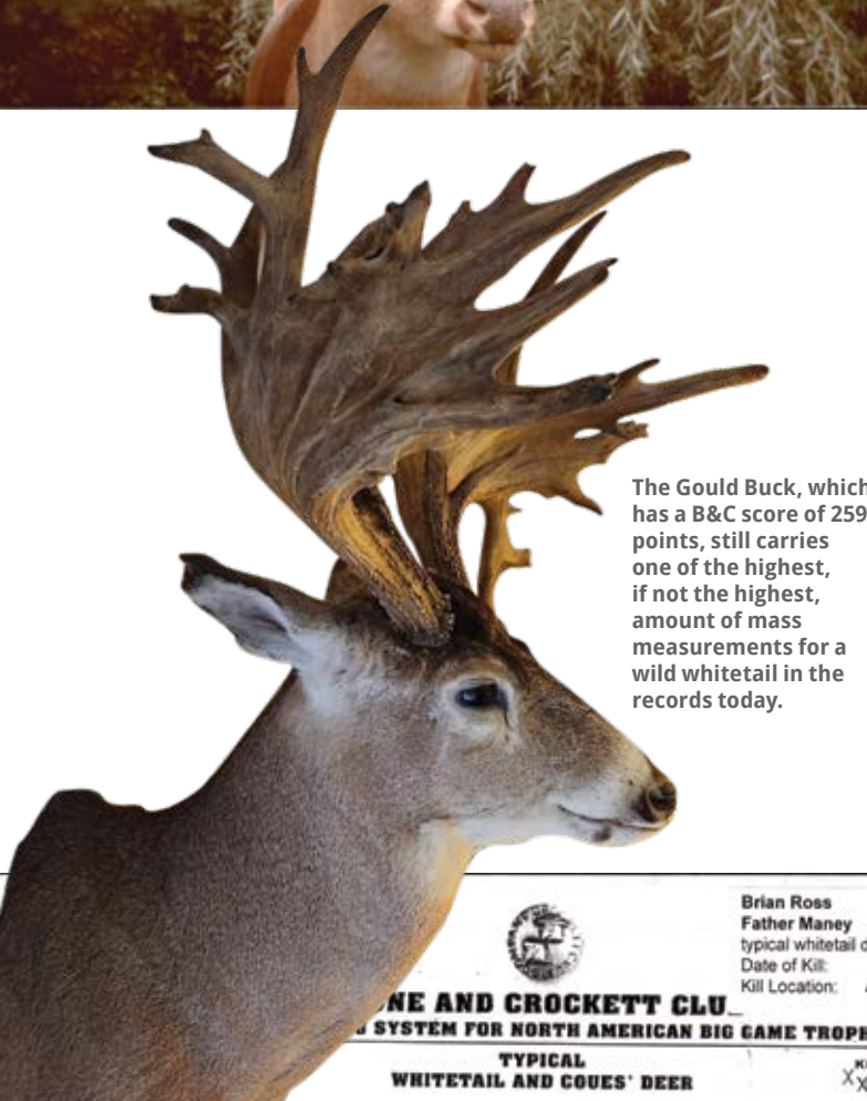
The Gould Buck, which has a B&C score of 259 points, still carries one of the highest, if not the highest, amount of mass measurements for a wild whitetail in the records today.

number of state records, including Maine's jaw-dropping number one non-typical, the Hill Gould buck.