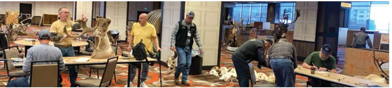
The Pope and Young Club's Biennial Convention Judges Panel was held in February 2023, in Reno, Nevada.

recently held in Reno, Nevada. Their next Judges Panel will also happen in 2025, making for a busy spring for both Club's records programs.