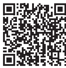
Read more about the new World's Record Rocky Mountain goat.