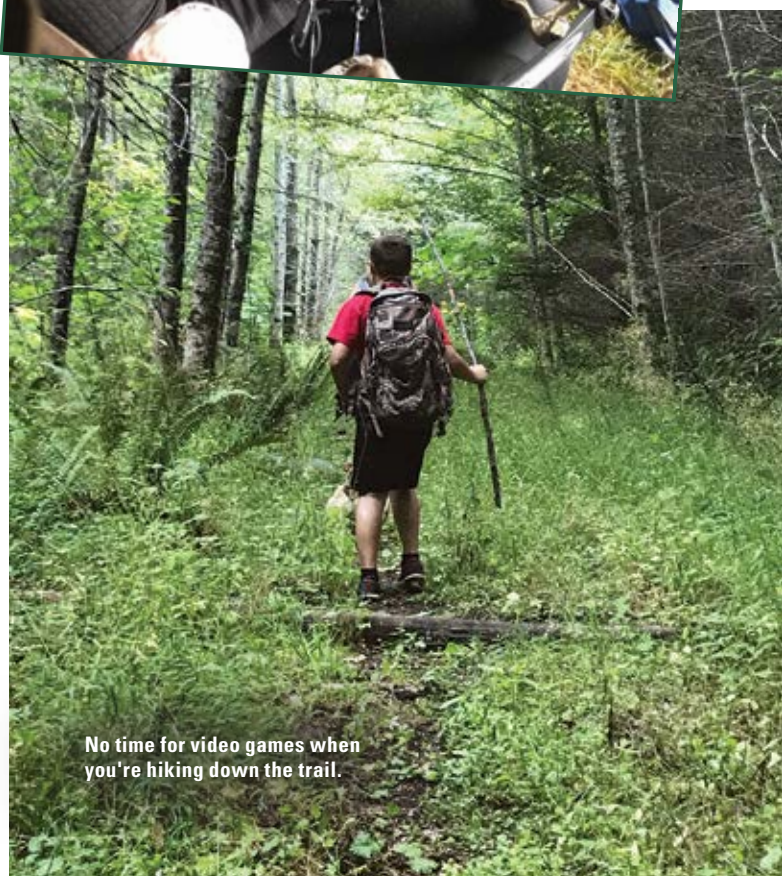
No time for video games when you're hiking down the trail.