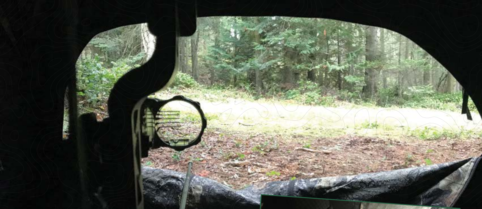
From the cozy confines of the hunting blind, compromises have to be made.

underestimate the power that a grade-schooler's stomach has over them. Just one hour into the day, we had a bird coming in, spitting and drumming the whole way. This is exactly what I had hoped would happen.