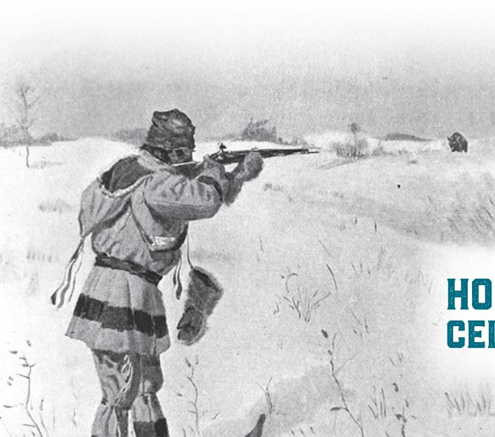
Caspar Whitney wrote On Snow-Shoes to the Barren Grounds after his expeditions in the wilds of northern Alberta. The illustration, by Frederic Remington, is in the chapter titled 'Our Wood Bison Hunt'.

DID YOU KNOW: To save the remnant populations of this woolly beast, the Canadian government set aside more than 17,000 square miles of wood buffalo habitat in northern Alberta in 1922. Today, we know it as Wood Buffalo National Park, a World Heritage Site and Canada's largest National Park.