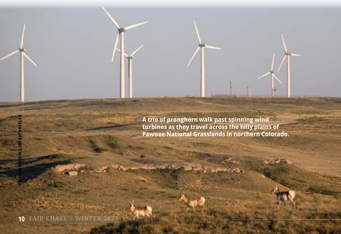
A trio of pronghorn walk past spinning wind turbines as they travel across the hilly plains of Pawnee National Grasslands in northern Colorado.