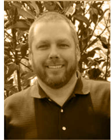
NCLI Cohort 1