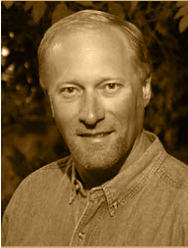
NCLI Cohort 3