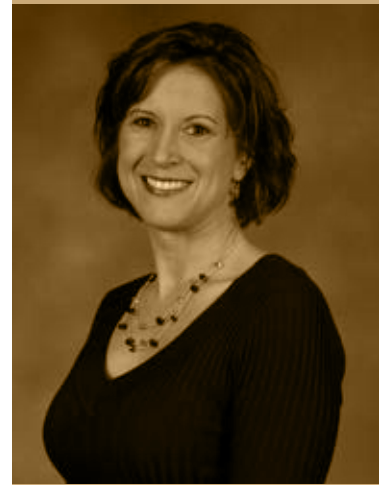
NCLI Cohort 1