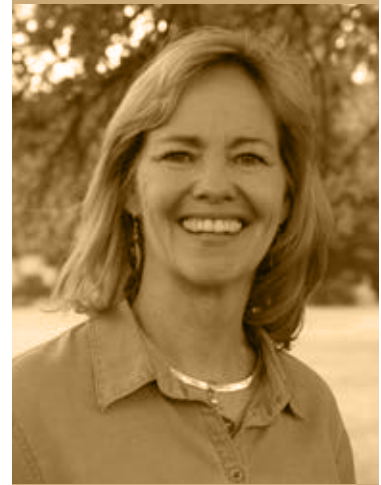
NCLI Cohort 1