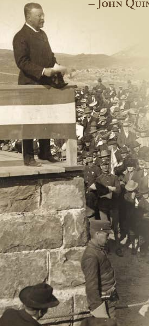
Theodore Roosevelt making a speech Yellowstone National Park, 1903