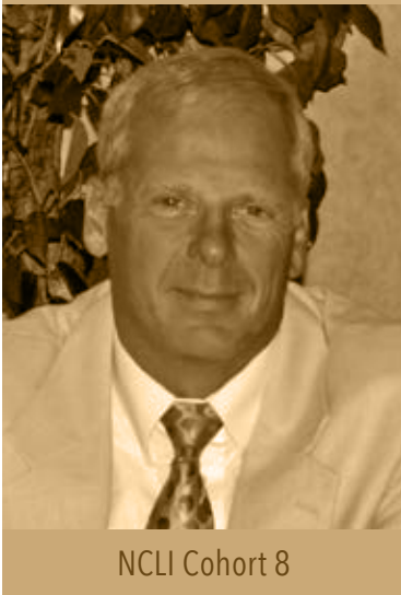
NCLI Cohort 8