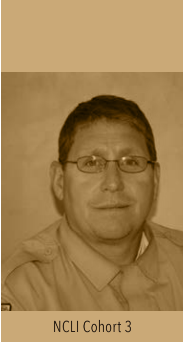
NCLI Cohort 3