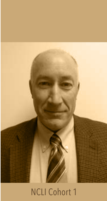
NCLI Cohort 1