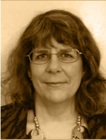
NCLI Cohort 4

NATIONAL COORDINATOR, LANDSCAPE CONSERVATION COOPERATIVES