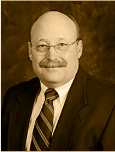
NCLI Cohort 4