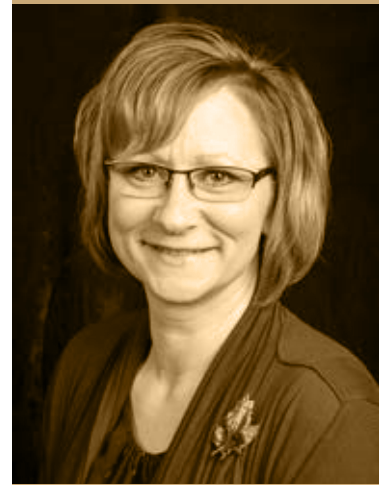
NCLI Cohort 6