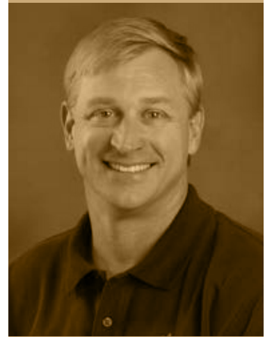
NCLI Cohort 4