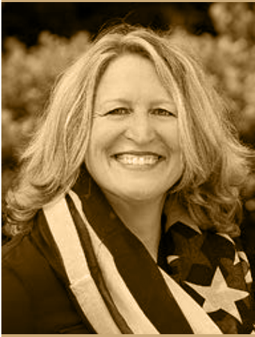
NCLI Cohort 2

DIRECTOR OF ARCHERY AND BOWHUNTING PROGRAMS