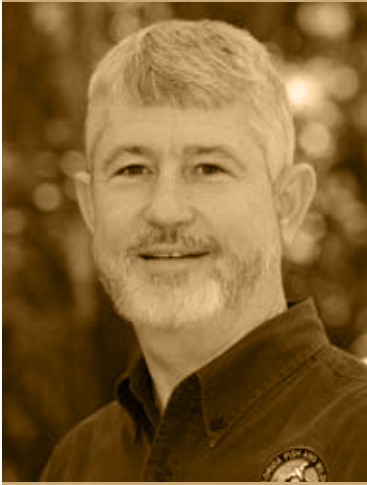
NCLI Cohort 3