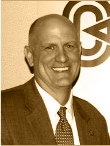
NCLI Cohort 3