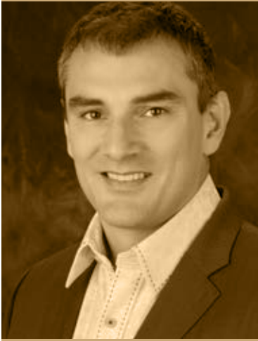
NCLI Cohort 5