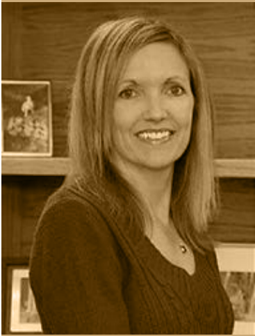
NCLI Cohort 3