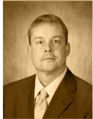
NCLI Cohort 1