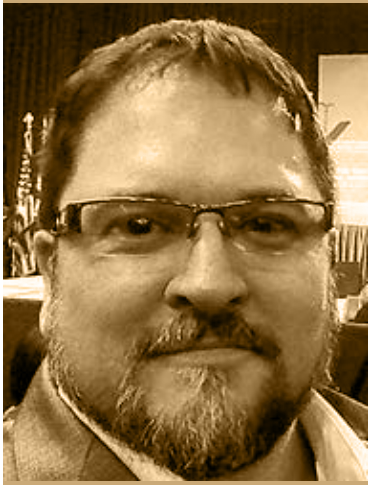
NCLI Cohort 1